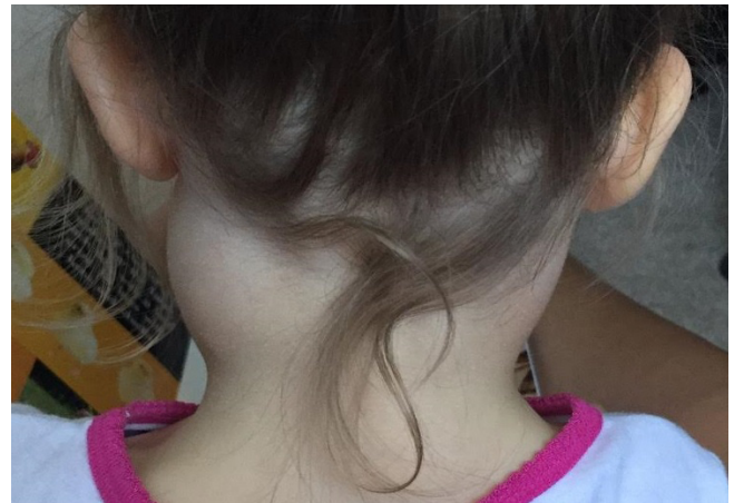
Figure 2. Image of massive lymphadenopathy of the patient mentioned in Case 3.

Two weeks later, the redness and swelling of her LNs increased, which were drained and the specimen grew MSSA (Methicillin sensitive Staphylococcus Aureus) with no growth of mycobacterium or fungus. Once the antibiotic course was completed, bilateral modified neck dissection and LN resection were performed. The AFB smear and culture on the specimens were negative; the bacterial and fungal cultures were negative as well. Flow cytometry showed no immunophenotypic evidence of B or T cell non-Hodgkin lymphoma. Pathological findings showed acute lymphadenitis, necrotizing with prominent histiocytes accumulation, and neutrophilic micro-abscess formation. We suspected that the MSSA was a superinfection on an underlying process. In the recent 15-month follow-up, there was no evidence of recurrence.